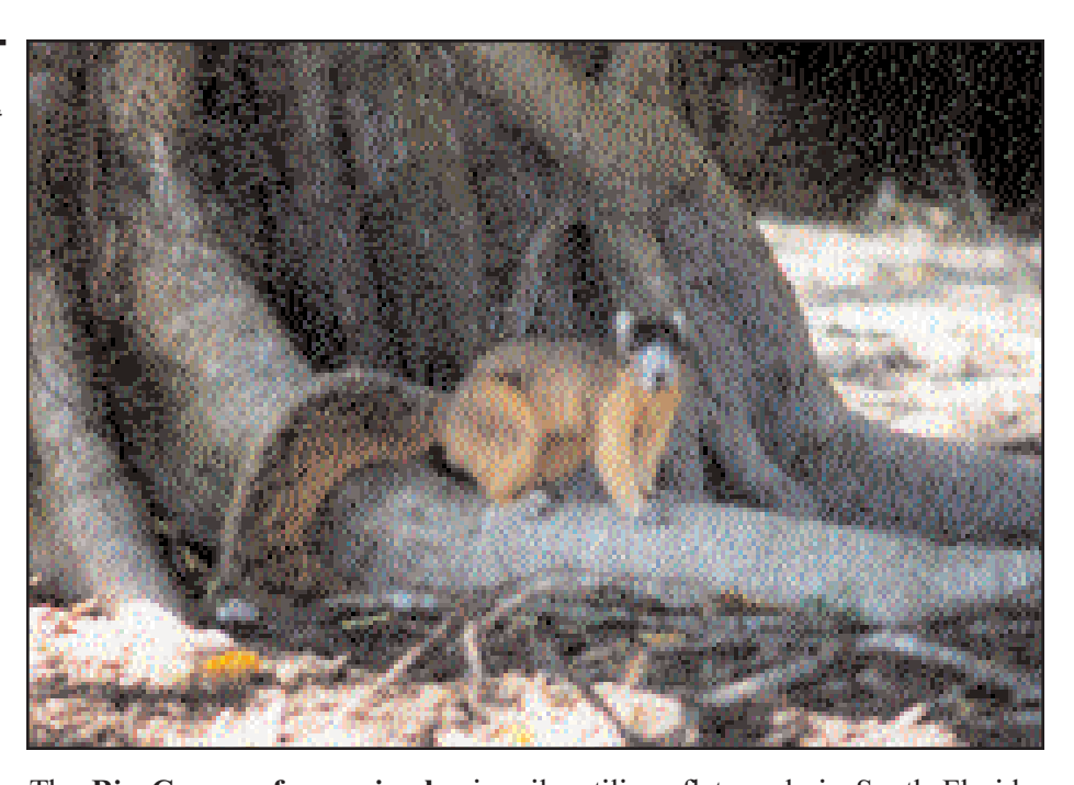
Big Cypress fox squirrel.

The Big Cypress fox squirrel primarily utilizes flatwoods in South Florida. Mesic pine flatwoods understories that are maintained open by fire can provide a good forage for the fox squirrel. The fox squirrel forages on male pine cones in winter, and female pine cones during the summer. Male and female cones from cypress, cabbage palm fruits, bromeliad buds, and acorns are also consumed (Humphrey and Jodice 1991). Mature mangrove forest, oak and hardwood hammocks, and riverine hardwoods adjacent to mesic pine flatwoods provide additional forage on a rotating seasonal basis. Nesting occurs in upland and wetland habitats in pines, oaks, black mangrove, cypress, and cabbage palms; often in bromeliad clumps. The Big Cypress fox squirrel is not observed in pine flatwoods dominated by a thick saw palmetto understory, monocultural dense melaleuca forest, Brazilian pepper forest, Australian pine stands, and man-made habitats that do not possess a superabundance of food. Maintaining large, unfragmented areas of mesic pine flatwood is important to the long-term survival and recovery of this charismatic mammal.