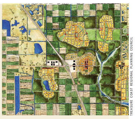
Concept for Towns/Villages/Countryside plan in St. Lucie County.

Assisted by the Treasure Coast Regional Planning Council, the community and county officials agreed on a master plan for 28 square miles (72 sq km) of farmland. This plan included several new towns and villages surrounded by countryside that would be preserved for agriculture and habitat restoration. A central backbone system for water management would