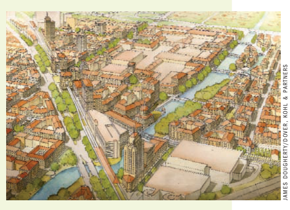
The vision for downtown Kendall.

Initially, form-based codes were developed as sets of instructions for developers to use when developing greenfield sites. Later, they were