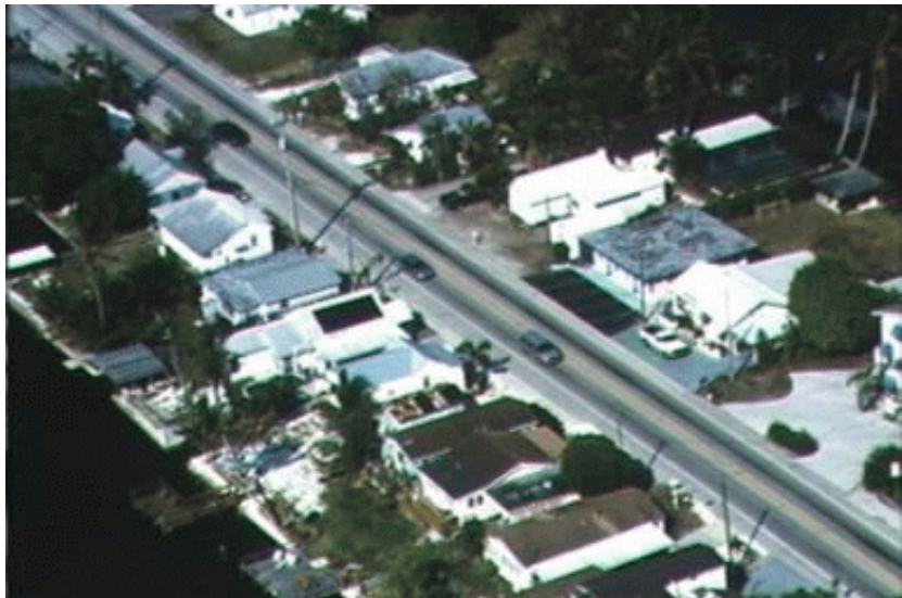
Matlacha historic district, bisected by Pine Island Road

Pine Island has two traffic problems resulting from the near-impossibility of widening Pine Island Road through Matlacha without destroying its historic district. This road is nearing its capacity for meeting the daily travel needs of Pine Islanders and visitors, and it is barely adequate for evacuating low-lying areas in case of tropical storms and hurricanes.