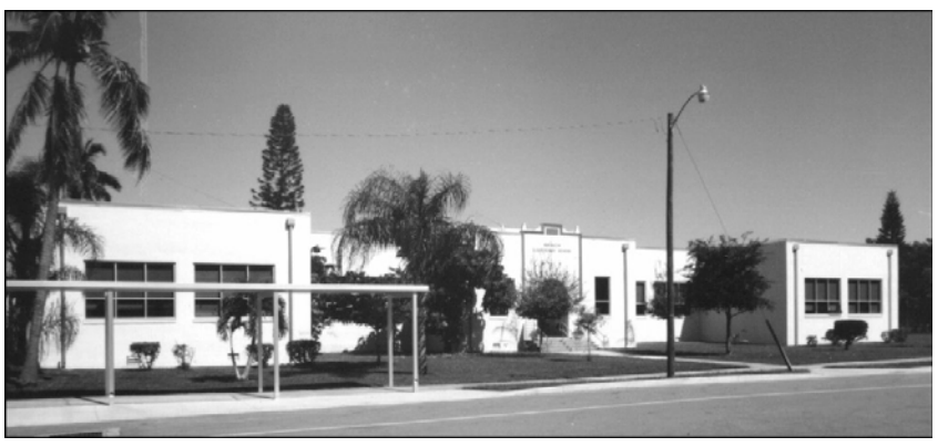
Figure 1, Fort Myers Beach Elementary School

Florida school districts follow the same boundaries as counties. There is only school within the Town of Fort Myers Beach, the historic public elementary school on Oak Street (see Figures 1 and 2). This school serves grades K through 5, with enrollment fluctuating from 165 to its current capacity of 200 students, all of whom live (at least seasonally) on Estero or San Carlos Islands or have parents who work there. Adding middle-school classrooms to this school would be warmly welcomed by town residents.