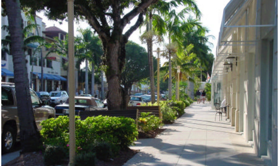
Downtown Naples encourages pedestrianism and window shopping by slowing traffic through use of landscaped buffers. Businesses are set closer to the street.