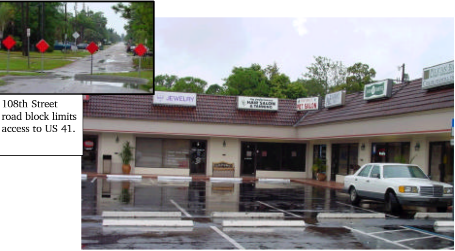
Businesses in Sunset Plaza receive less patronage due to a road block preventing through traffic down 108th Street to US 41.

Adequate parking is essential for the success of these retailers – parking must be visible from US-41. Road networks are also important. Neighborhood access points must not be blocked off. Businesses benefit from a road network that is easily navigable, two-way, and does not siphon retailers off from the adjacent community. Sunset Plaza is an example of a poorly planned road network. Retailers are suffering from a road block that does not permit residential through traffic to access US-41. Easy access, convenient parking, and visibility are all integral components to retailing success.