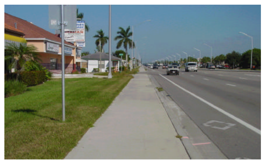
US 41 lacks a landscape buffer between road and sidewalk. High traffic speeds deter pedestrianism. Businesses are set back from US 41,making it difficult to notice businesses.